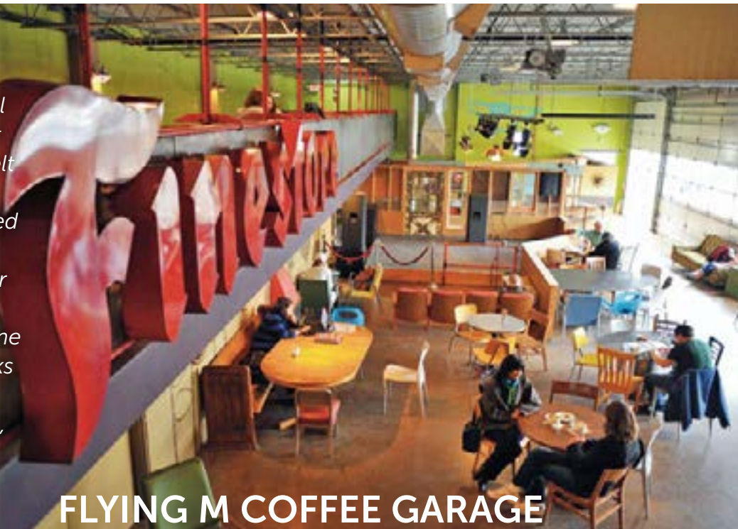
FLYING M COFFEE GARAGE