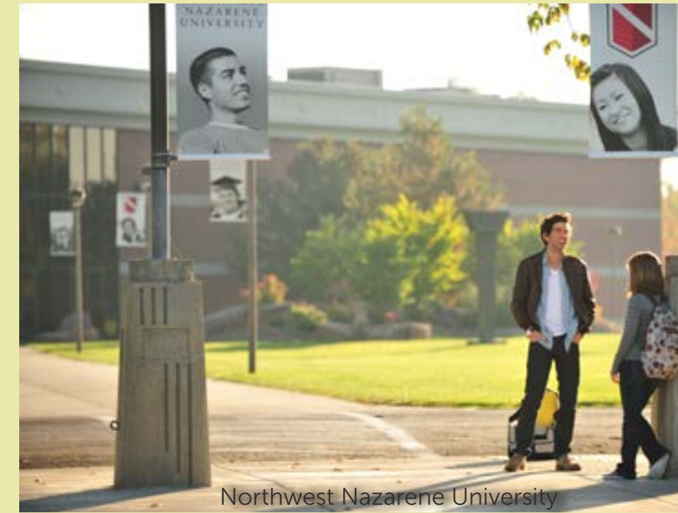
Northwest Nazarene University

College of Western Idaho (CWI) is one of the fastest growing community colleges in the nation. Since its first offering of classes in January 2009, enrollment at CWI has grown to service more than 28,000 students a year. CWI has seven campus locations throughout Boise and Nampa, plus hundreds of classes online. In the fall of 2012, CWI introduced a new 176,000 sq. ft. state-of-the-art facility to provide professional-technical training opportunities in the Valley. Programs can be coordinated with workforce development for local companies with specialization in drafting, electronics, machine tooling, and transportation technology, as well as welding and metals fabrication.